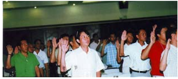
The delegates reciting the PSME Creed

In the evening was a fellowship night for all the delegates and invited guests which included members of the PSME Ladies Circle Manila. The organizer a lively and interesting program which truly fostered camaraderie among members through live musical entertainment, raffle draw and awarding of winners of the JPSME Quiz Bee and the different sports events.