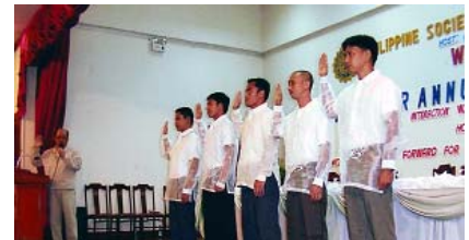
The induction of the new PSME CDO Chapter members