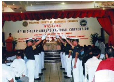
The entry of colors